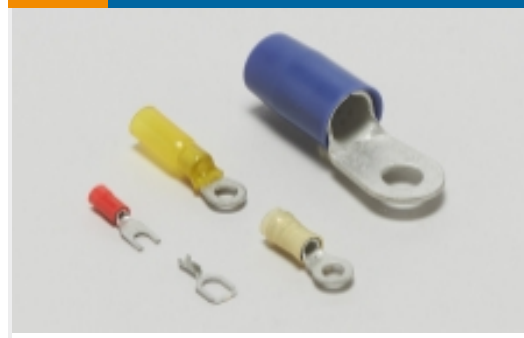
Ring Terminals & Spade Terminals(861)